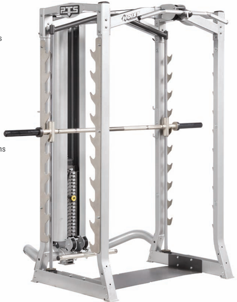
PTS-1000 shown with optional PTS-LAT and PTS Weight Stack Shields (1 pair)