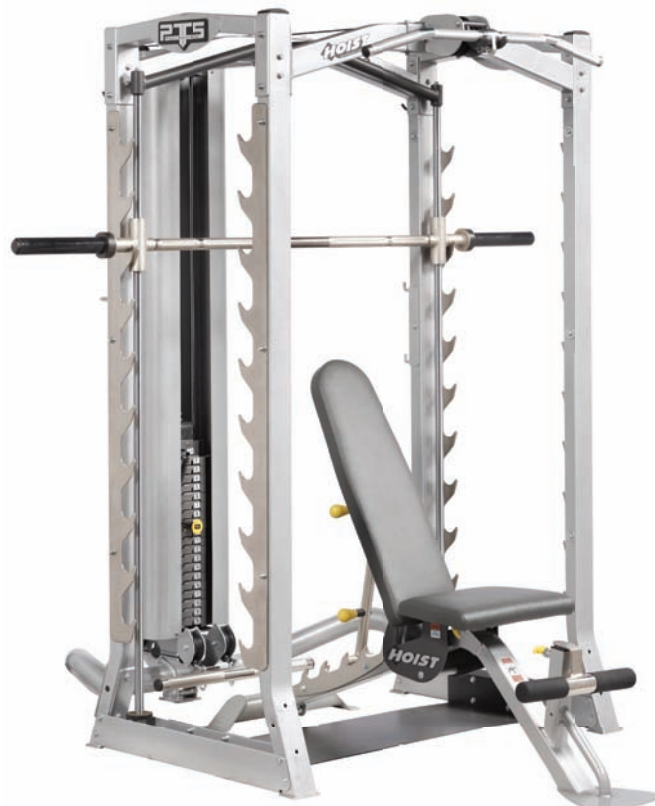
PTS-ENS-1 shown with HF-4165 bench

* Specifications does NOT include PTS-164 or HF-4165 benches