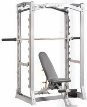
PTS-1000 shown with optional HF-4165 bench

The stand out feature of the PTS is the revolutionary Dual Action technology (US Patent #7,393,309) that produces simultaneous horizontal and vertical bar movement, providing the benefits of freeweight training but with added safety and stability. Coupled with the Ultra-Lite Lifting System ™ that reduces the bar weight to a mere 30 lbs., the PTS provides the freedom to perform endless exercises and achieve the results that have become synonymous with HOIST ® .