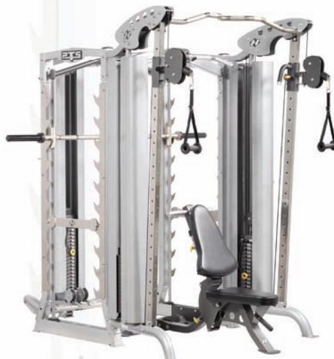
PTS-ENS-3 shown with optional PTS-164 bench