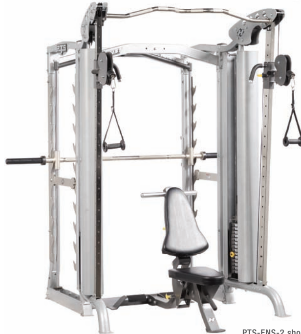
PTS-ENS-2 shown with PTS-164 bench

* Specifications does NOT include PTS-164 or HF-4165 benches