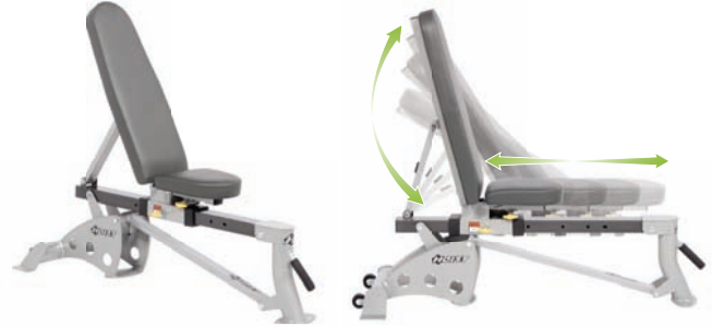
FOLD-UP FLAT/INCLINE BENCH (HF-4167)

For more information, please contact a HOIST® Sales Representative at 800.548.LIFT (5438) or sales@hoistfitness.com. NOTE: Actual frame and upholstery colors may differ from printed color samples shown.