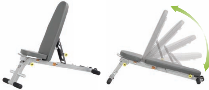
MULTI-POSITION BENCH (HF-4145)

To make your workout even more effective, HOIST® offers additional bench options that are sold separately. All benches feature unique space saving designs and superb components. Contact your HOIST® representative for more information.