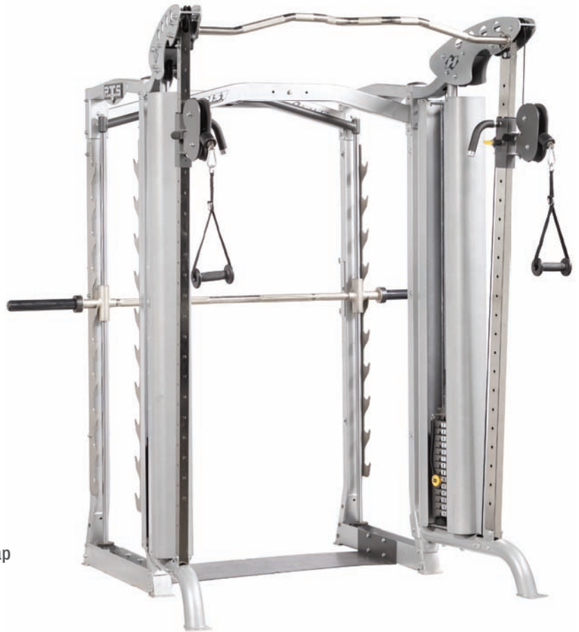
PTS-1000 shown with optional PTS-HILO and PTS Weight Stack Shields (2 pairs)